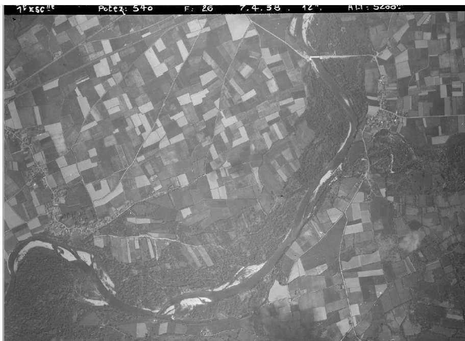
Figure 3: 1938's aerial view of the area before the construction of the Industrial Site of Lacq Source: Géoportail, 1938.

Before the arrival of extractive industries, the region was essentially rural as can be seen in Figure 3, an aerial photograph from April 1938 of where is today the industrial site.