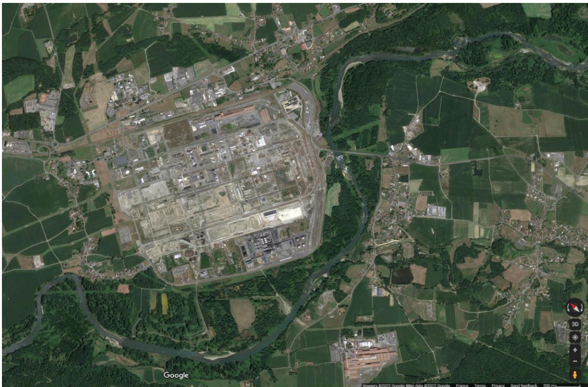
Figure 4: 2021's aerial view of the area of the Industrial Site of Lacq

The beginning of the gas exploitation was disturbed by an accident between 1951 to 1952. After the oil discovery, specialists knew that deeply more oil or gas could be present, so the drilling was carried on.