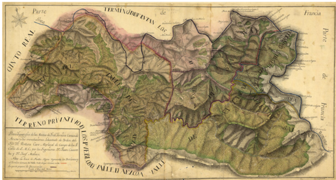
Fig. 1 Plano topografico de los Montes de Yrati , by Juan Casanoba & Josef Martinez (circa 1790, scale 1 :29,000).

Secondly, the joint recognition of the border confines by Commissioners Caro and d’Ornano enabled the representatives of the communities concerned to reaffirm their positions regarding their rights over the disputed massif. As Daniel Norman explains, this approach corresponded to the current territorial model, based on a pyramid - like superimposition of rights attached to the place in question (Nordman 1998). Thus, on 7 June 1788, the deputies of Cize, Saint-Jean-Pied-de-Port and Aezcoa were summoned to boundary marker 197 in Iriburietaco-Lepoa and were given a public reading of “documents that each of them could produce in justification of their rights, [...] aloud, in the common Basque language, [...] and in the Spanish and French idioms 16 ”. All the parties then recognised “as the true dividing line between their properties and pos-sessions, that specified in the aforementioned arbitral award of 13 August 1556 17 ”.