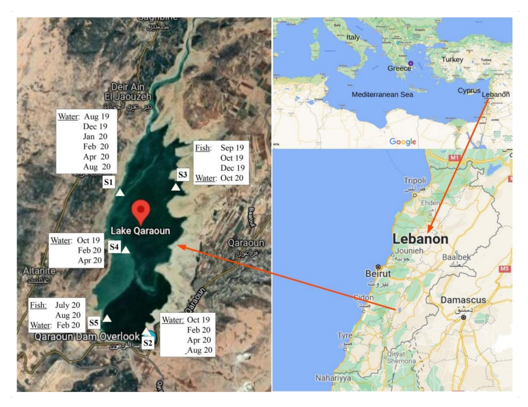
Figure 4. Map and sampling points of Lake Karaoun, Lebanon.

During field campaigns that covered the wet and dry periods, 16 water samples along with a total of 9 specimens of Cyprinus carpio fish (weighing 215 g on average) were collected mainly by the national Litani River Authority. All water samples were collected in polyethylene bottles from 5 sampling points of Lake Karaoun (S1, S2, S3, S4 and S5). S1 was located close to the river input at the west bank, S2 was east of the dam, S3 was close to the river input at the east bank, S4 was in the middle of the lake and S5 was at the dam (Figure 4). Water samples were transported in coolers (at a temperature of 4 °C) for laboratory analysis in Beirut, Lebanon and Athens, Greece. The fish were kept on ice and were sacrificed within 24 h. Fish liver and muscle sub-samples were labeled and frozen separately at -20 °C. The frozen fish tissue samples were then lyophilized with a Labconco freeze-dryer for 48 h at -84 °C and 0.2 mbar and powdered using a pestle and a mortar.