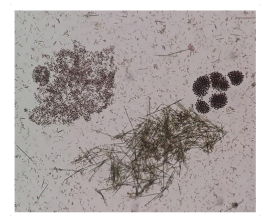
Figure 2. Dominant cyanobacteria species in Lake Karaoun: Microcystis aeruginosa and Aphanizomenon ovalisporum .