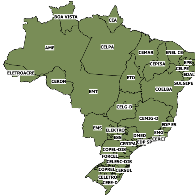
Figure 2: Map of Brazilian main discos

sumers, who can choose from whom to purchase electricity among several retailers; and captive consumers who are obliged to purchase their electricity from the local disco. Among the captive, one may separate them between high-voltage (HV) and low-voltage (LV) consumers. The former might be distinguished among voltage ranges and each one presents a certain tariff, based on time-of-use, load and volumetric charges structures. The latter shows two types of tariffs in which the consumer can choose: a time-of-use volumetric and an average volumetric structures. Still, they are subdivided among residential, rural, industrial and commercial consumers and each of them has a specific tariff. The great majority of residential consumers chooses the average volumetric tariffs, due to its advantages concerning the consumer profile throughout the day. There are still social subsidized tariffs, but they are excluded from the analysis. In Brazil, LV consumers presents a minimum consumption depending on the type of private grid connexion.