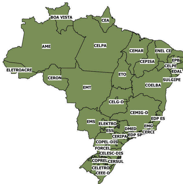
Figure 2: Map of Brazilian main discos

sumers, who can choose from whom to purchase electricity among several retailers; and captive consumers who are obliged to purchase their electricity from the local disco. Among the captive, one may separate them between high-voltage (HV) and low-voltage (LV) consumers. The former might be distinguished among voltage ranges and each one presents a certain tariff, based on time-of-use, load and volumetric charges structures. The latter shows two types of tariffs in which the consumer can choose: a time-of-use volumetric and an average volumetric structures. Still, they are subdivided among residential, rural, industrial and commercial consumers and each of them has a specific tariff. The great majority of residential consumers chooses the average volumetric tariffs, due to its advantages concerning the consumer profile throughout the day. There are still social subsidized tariffs, but they are excluded from the analysis. In Brazil, LV consumers presents a minimum consumption depending on the type of private grid connexion.