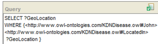
Fig.3. Geo-location SPARQL query

To retrieve the data stored in an ontology there are several query languages, the most common is called SPARQL [11]. In the following figure, an example of a SPARQL query asking for the patient's geo-location.