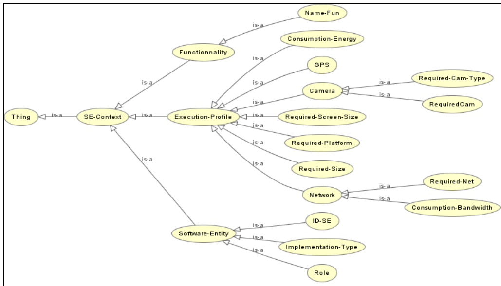
Fig. 2. Software entity context ontology.

Thereby, software entity description concerns not only functional characteristics but also must be rich enough to provide scope awareness to can performing a better selection task. The ontology model presented in Fig.2 describes the functional description and all the necessary conditions for the execution of a software entity.