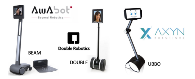
Fig. 1: Used telepresence robots

Our experience shows that connection problems are the main factor of impact on motivation to use the robot.