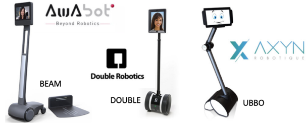
Fig. 1: Used telepresence robots

Our experience shows that connection problems are the main factor of impact on motivation to use the robot.