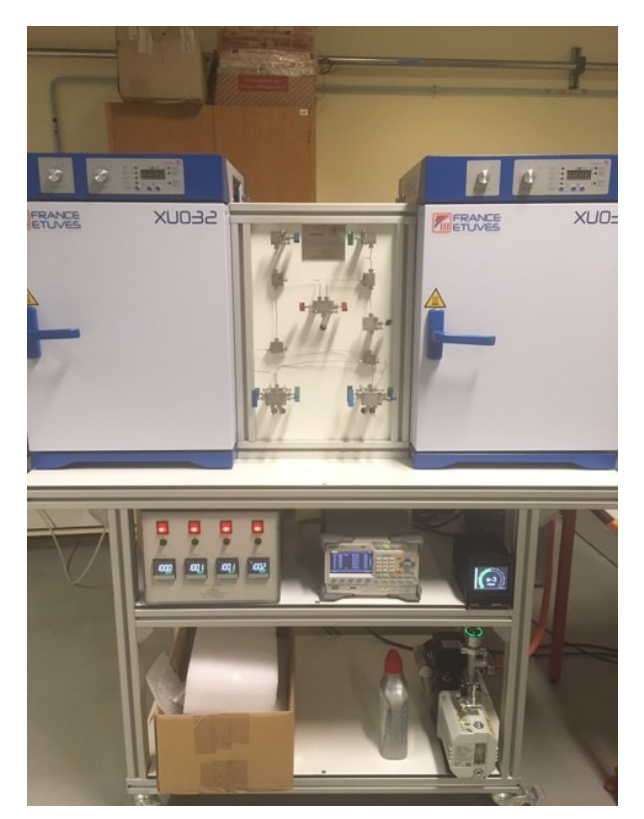
Figure 2: Photograph of the corrosion pilot

In this study, a corrosion pilot (Figure 2) has been developed to conduct investigations on materials. Four autoclaves made of titanium are divided two by two in ovens. The autoclave can operate until 473 K and 20 MPa. An inert insert is placed in the cell to avoid the contact between the titanium and the fluid or the exposed materials. Temperature probes and pressure sensor enable the monitoring of experimental conditions.