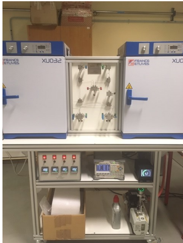
Figure 2: Photograph of the corrosion pilot

In this study, a corrosion pilot (Figure 2) has been developed to conduct investigations on materials. Four autoclaves made of titanium are divided two by two in ovens. The autoclave can operate until 473 K and 20 MPa. An inert insert is placed in the cell to avoid the contact between the titanium and the fluid or the exposed materials. Temperature probes and pressure sensor enable the monitoring of experimental conditions.